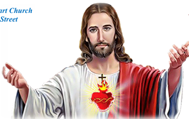
St. Philip Neri Mission Church 60676 NY-30, Grand Gorge, NY 12474