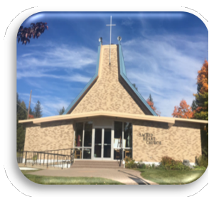
Sacred Heart Church 27 Harper Street Stamford, NY 12167