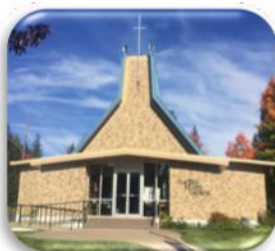
Sacred Heart Church 27 Harper Street Stamford, NY 12167