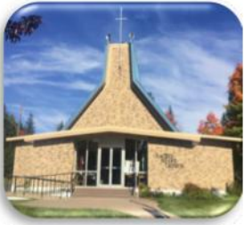
Sacred Heart Church 27 Harper Street Stamford, NY 12167