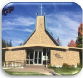
Sacred Heart Church 27 Harper Street Stamford, NY 12167