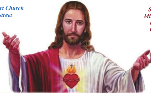
St. Philip Neri Mission Church 60676 NY-30, Grand Gorge, NY 12474