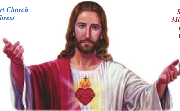
St. Philip Neri Mission Church 60676 NY-30, Grand Gorge, NY 12474