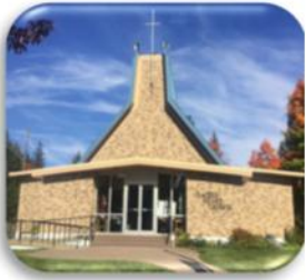
Sacred Heart Church 27 Harper Street Stamford, NY 12167