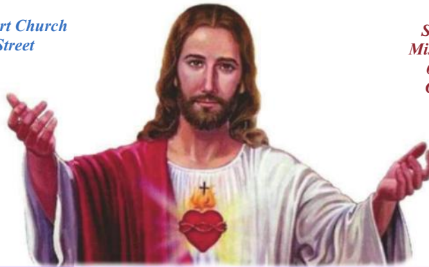
St. Philip Neri Mission Church 60676 NY-30, Grand Gorge, NY 12474