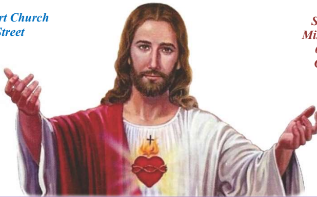
St. Philip Neri Mission Church 60676 NY-30, Grand Gorge, NY 12474