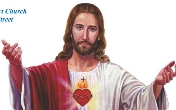
St. Philip Neri Mission Church 60676 NY-30, Grand Gorge, NY 12474