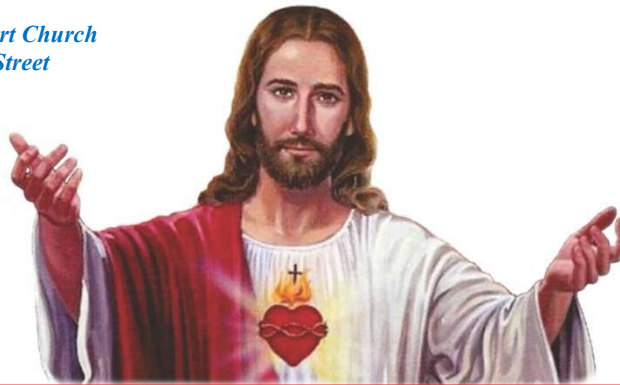
St. Philip Neri Mission Church 60676 NY-30, Grand Gorge, NY 12474