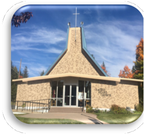
Sacred Heart Church 27 Harper Street Stamford, NY 12167