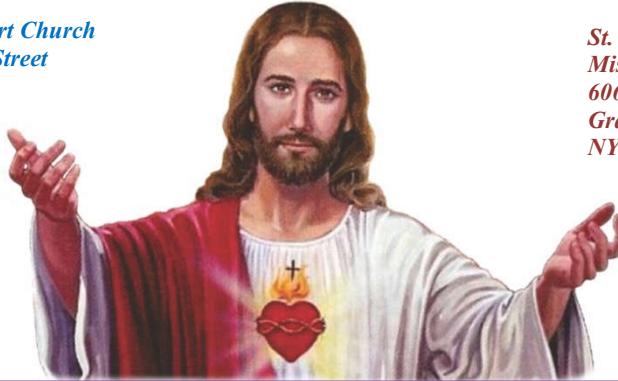
St. Philip Neri Mission Church 60676 NY-30, Grand Gorge, NY 12474