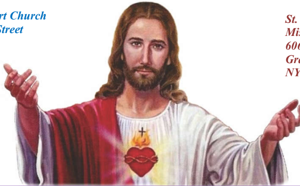
St. Philip Neri Mission Church 60676 NY-30, Grand Gorge, NY 12474