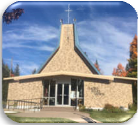
Sacred Heart Church 27 Harper Street Stamford, NY 12167