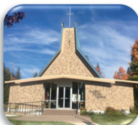
Sacred Heart Church 27 Harper Street Stamford, NY 12167