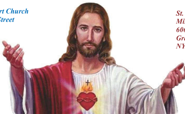
St. Philip Neri Mission Church 60676 NY-30, Grand Gorge, NY 12474