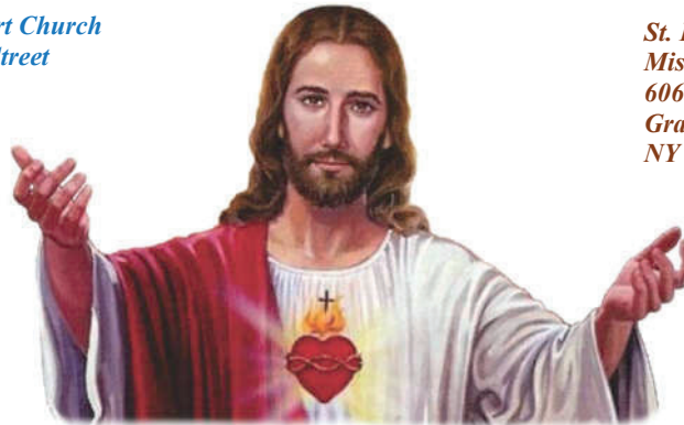
St. Philip Neri Mission Church 60676 NY-30, Grand Gorge, NY 12474