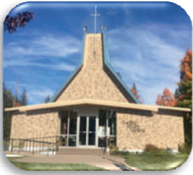
Sacred Heart Church 27 Harper Street Stamford, NY 12167