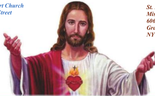
St. Philip Neri Mission Church 60676 NY-30, Grand Gorge, NY 12474