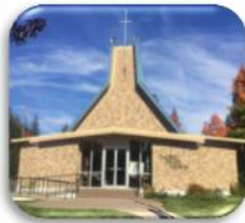
Sacred Heart Church 27 Harper Street Stamford, NY 12167